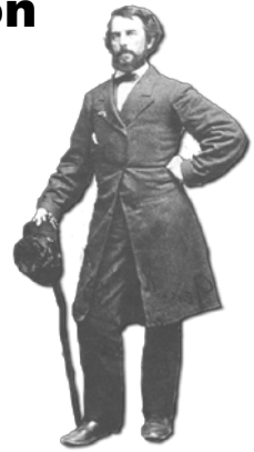
Brigadier General Rufus King